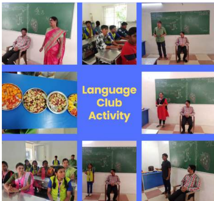
Language Club Activity