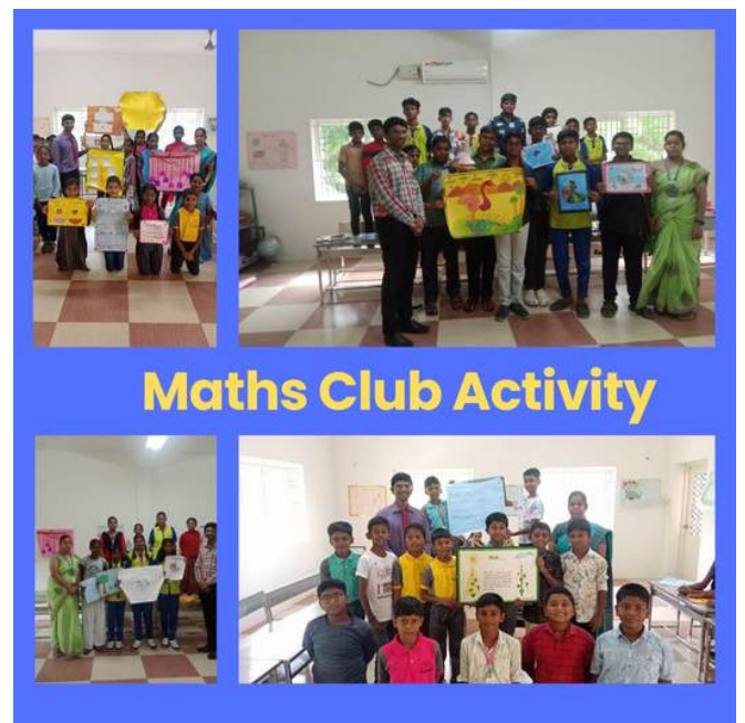
Maths Club Activity